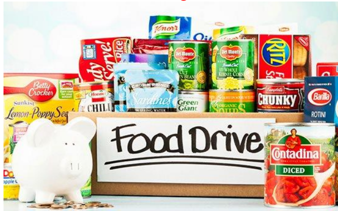
1st Annual Food Drive & Personal Care Item Collection